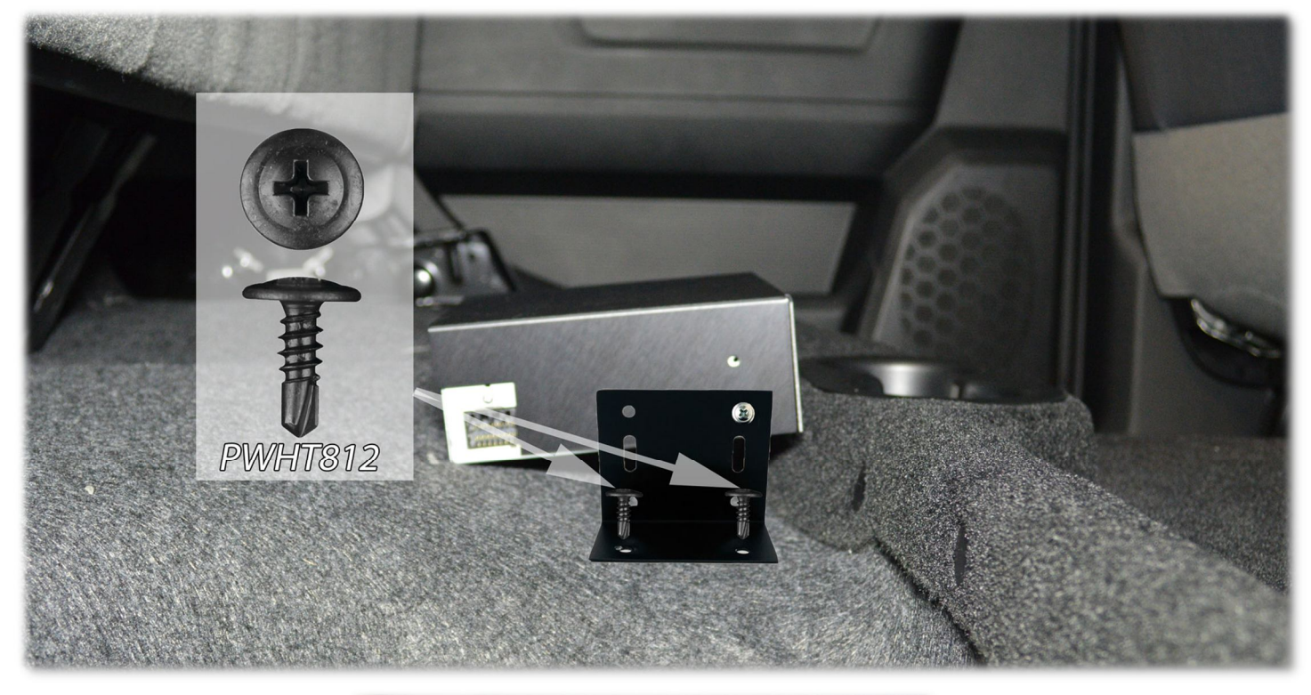
Example: RAM Truck Crew-Cab, player mounted under rear seat: